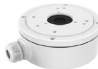
1280ZJ-S Junction Box